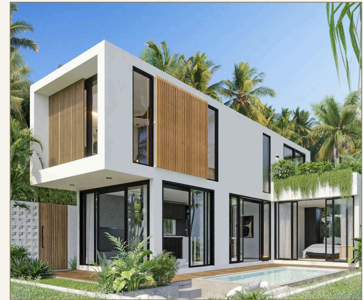
MODERNA OAK 5 BEDROOM