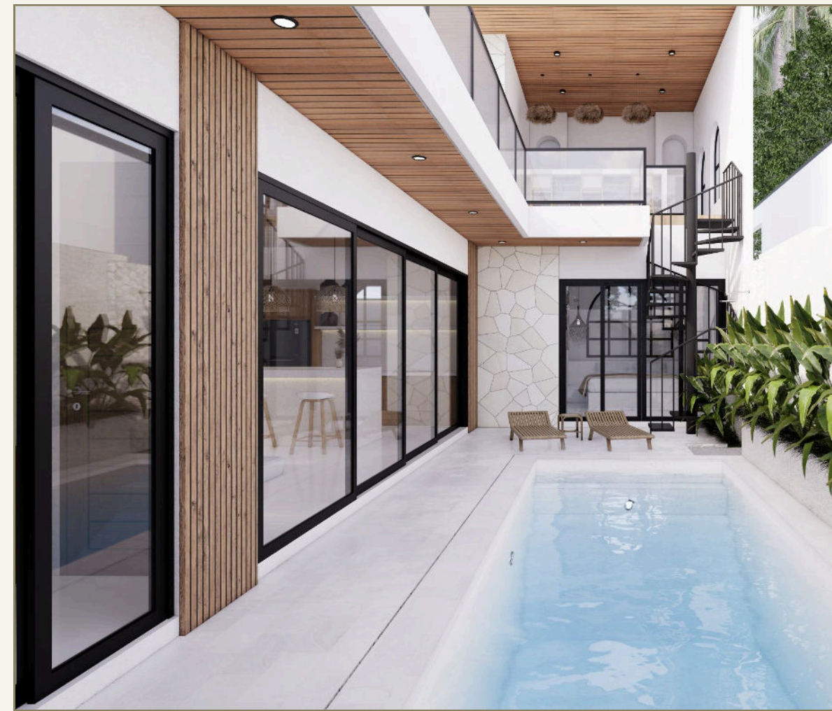
LILLY 4 BEDROOM

One is bold and sculptural, made for grand gatherings and golden hours that stretch late into the evening. The other, calm and refined – a sanctuary of light, breeze, and effortless elegance. Both are architectural statements, thoughtfully crafted for beachfront living, and for those who understand the quiet power of first position.